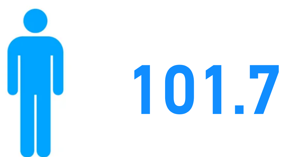
Incidence among Male

Death rate in Missouri with Prostate cancer per 100 thousand is