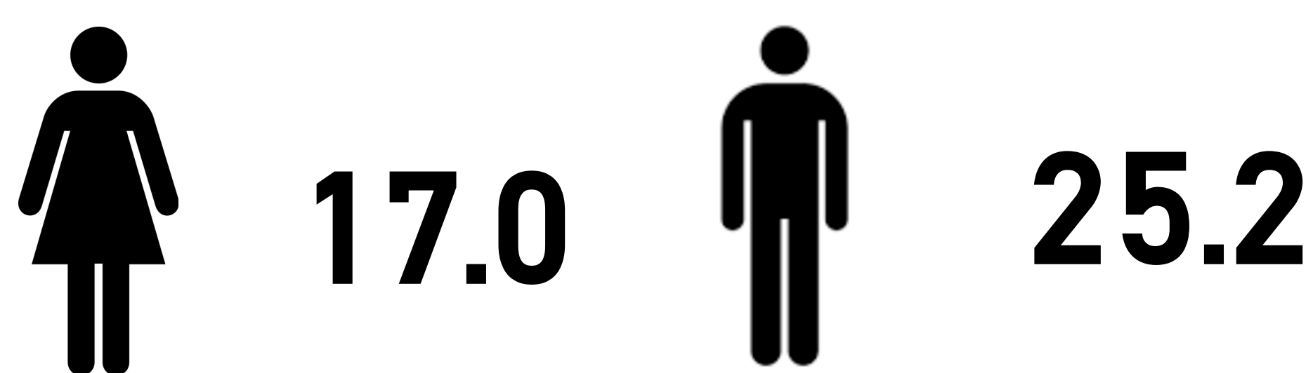
Incidence rate by Gender

Missouri ranked 20th in the death rate of Melanoma in the US***