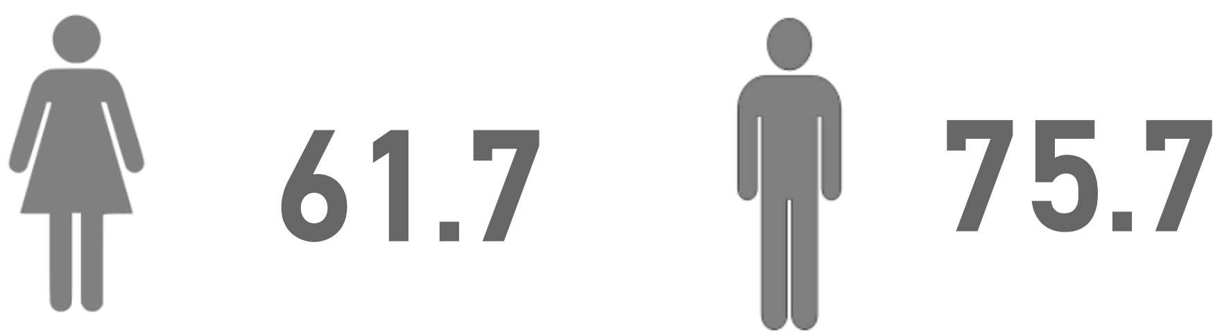
Incidence rate by Gender

Missouri ranked 7th in the death rate of Lung cancer in the US**