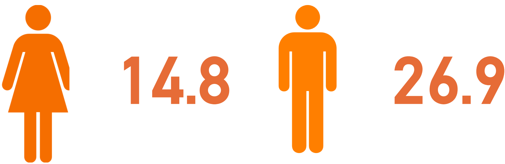
Incidence rate by Gender

Missouri ranked 12th in the death rate of Kidney and Renal Pelvis in the US**