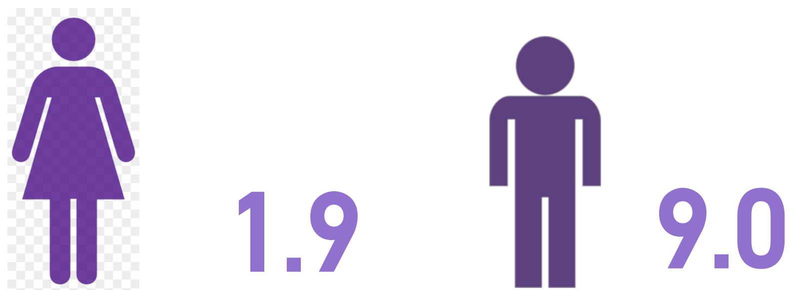
Incidence rate by Gender

Death rate in Missouri with Esophagus cancer per 100 thousand is