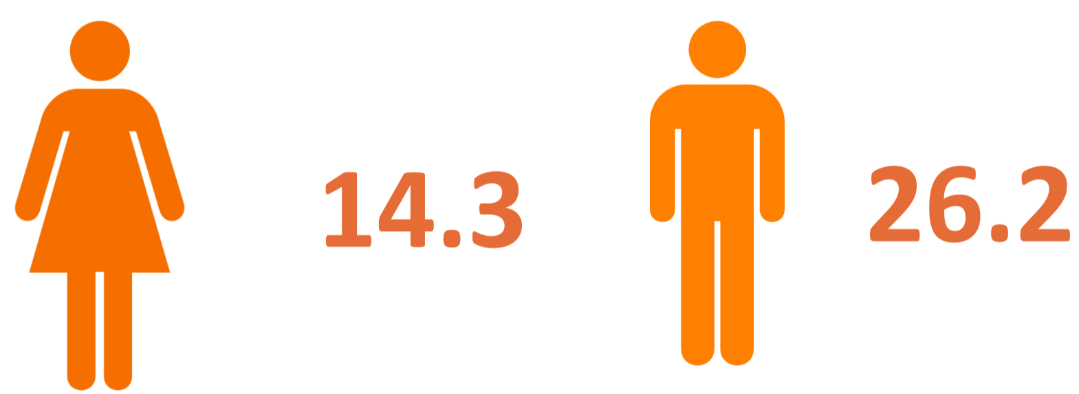
Incidence rate by Gender

Missouri ranked 12th in the death rate of Kidney and Renal Pelvis in the US**