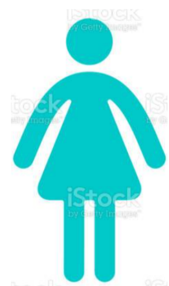
Incidence rate in Female