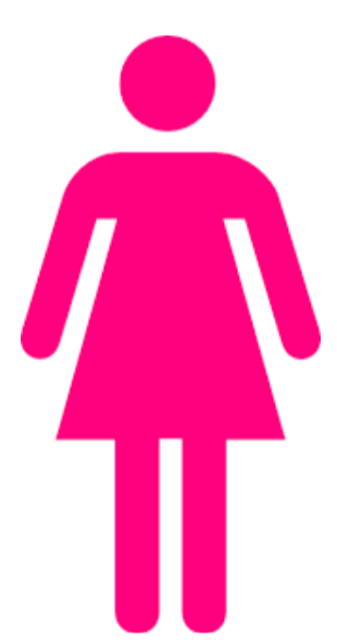
Incidence rate in female