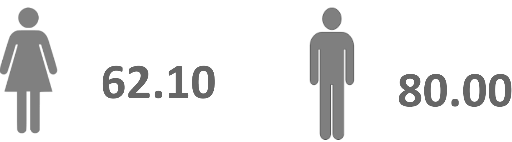
Incidence rate by Gender

Missouri ranked 8th in the death rate of Lung cancer in the US**